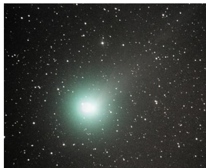
Comet Lovejoy